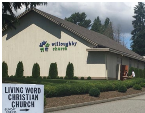
2020 - Relocated to Willoughby Christian Reformed Church