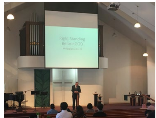
July 12, 2020 - First Service at Willoughby Christian Reformed Church

LWCC currently consists of 35 families with 50 members and an average attendance between 70-80 (including children) every Sunday.