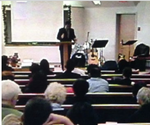
2003 - Brookwood Baptist Church

Highlights of the Living Word family during this time included the annual church family camp held at Camp Luther (2003 to 2008), Othello Tunnels Campground (2009) and Camp Hope (2010) with an average of about 25 families in attendance.