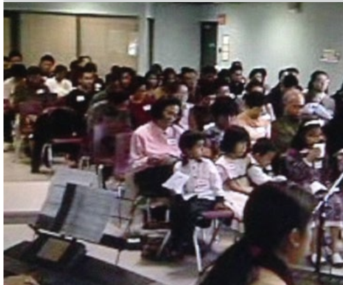
2002 - Timm's Community Centre