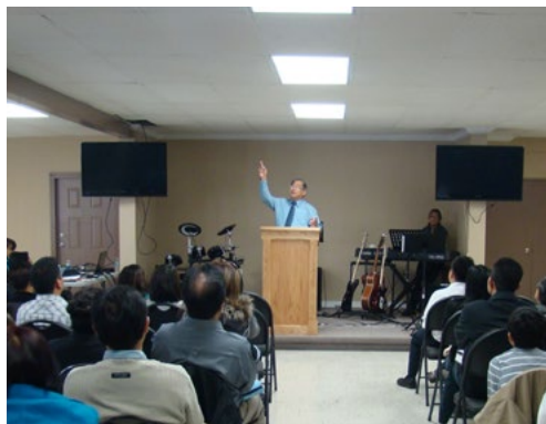
2010 - Relocated to a property in Willoughby