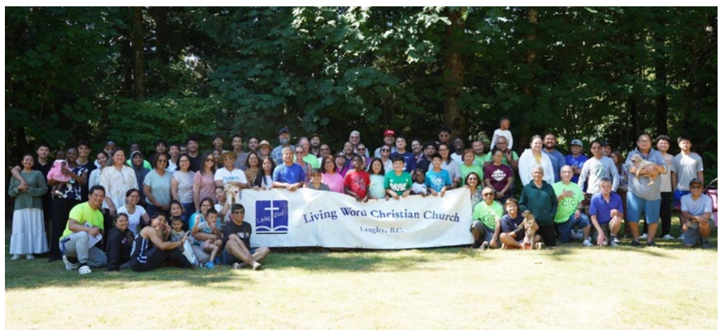
2025 - Annual Family Camp at Camp Hope

“Now to Him who is able to do far more abundantly beyond all that we ask or think, according to the power that works within us, to Him be the glory in the church and in Christ Jesus to all generations forever and ever. Amen.” (Ephesians 3:20-21 NASB)